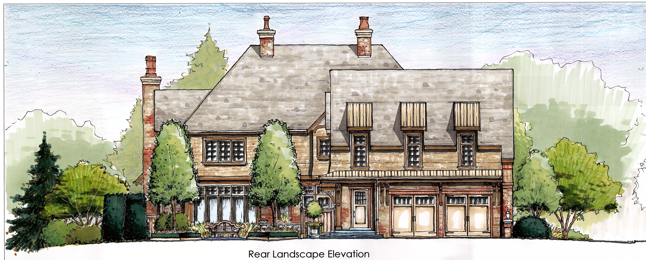
Rear Landscape Elevation